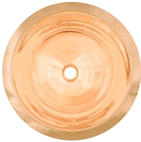
Shown in PRG