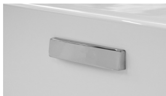
Rectangular overflow included

Slim-Line Overflow with Toe Tap Drain Solid Brass Drain Chrome (SLOTSBC) $930 Brushed Nickel (SLOTSBBN) $935 Polished Nickel (SLOTSBPN) $935 White (SLOTSBW) $965