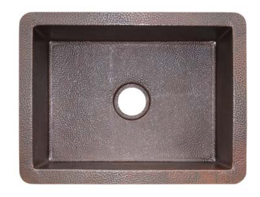
CPK279- Antique CPK579- Brushed Nickel